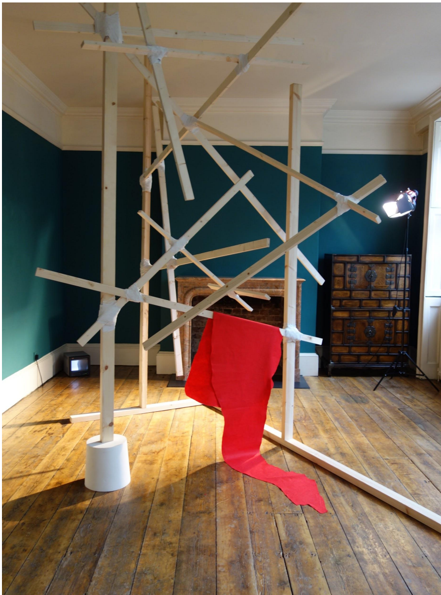
Untitled , plywood, plaster, modroc, felt, video and stage light, dimensions variable, Danielle Arnaud Gallery, London, 2020. This work is part of the development of work from the research undertaken at The British School at Rome as the Creative Wales Fellow in 2019.