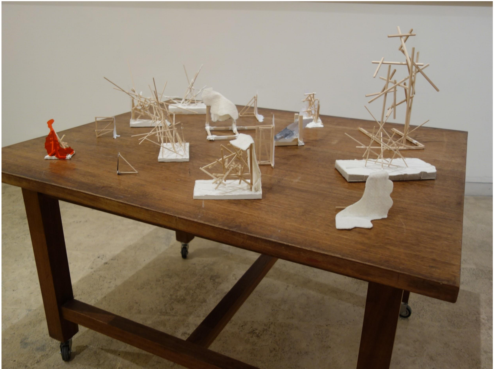
A Script for an Archive , models for possible sculptures, felt, plywood, plaster, The British School at Rome, 2019 Produced during my fellowship at The British School of Rome whilst researching The Bulwer Collection and Cinecitta Film Studios.