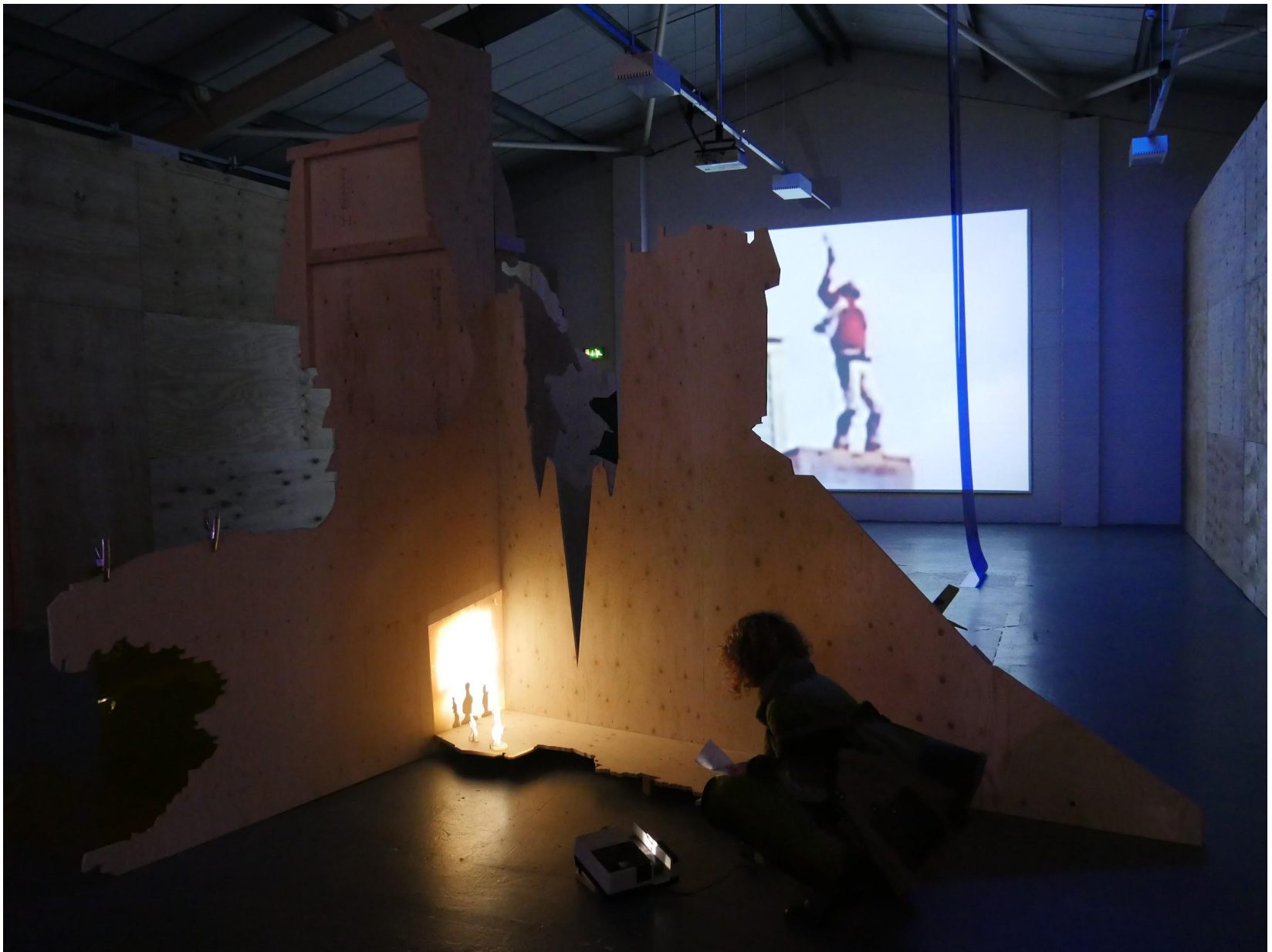
The Conversation , plywood, projection, film lighting gel, audio, dimensions variable, g39, Cardiff, 2018. This body of work was a result of developing studio work during a Creative Wales Award when I researched photographic images from the Los Angeles Universal Studio tour.