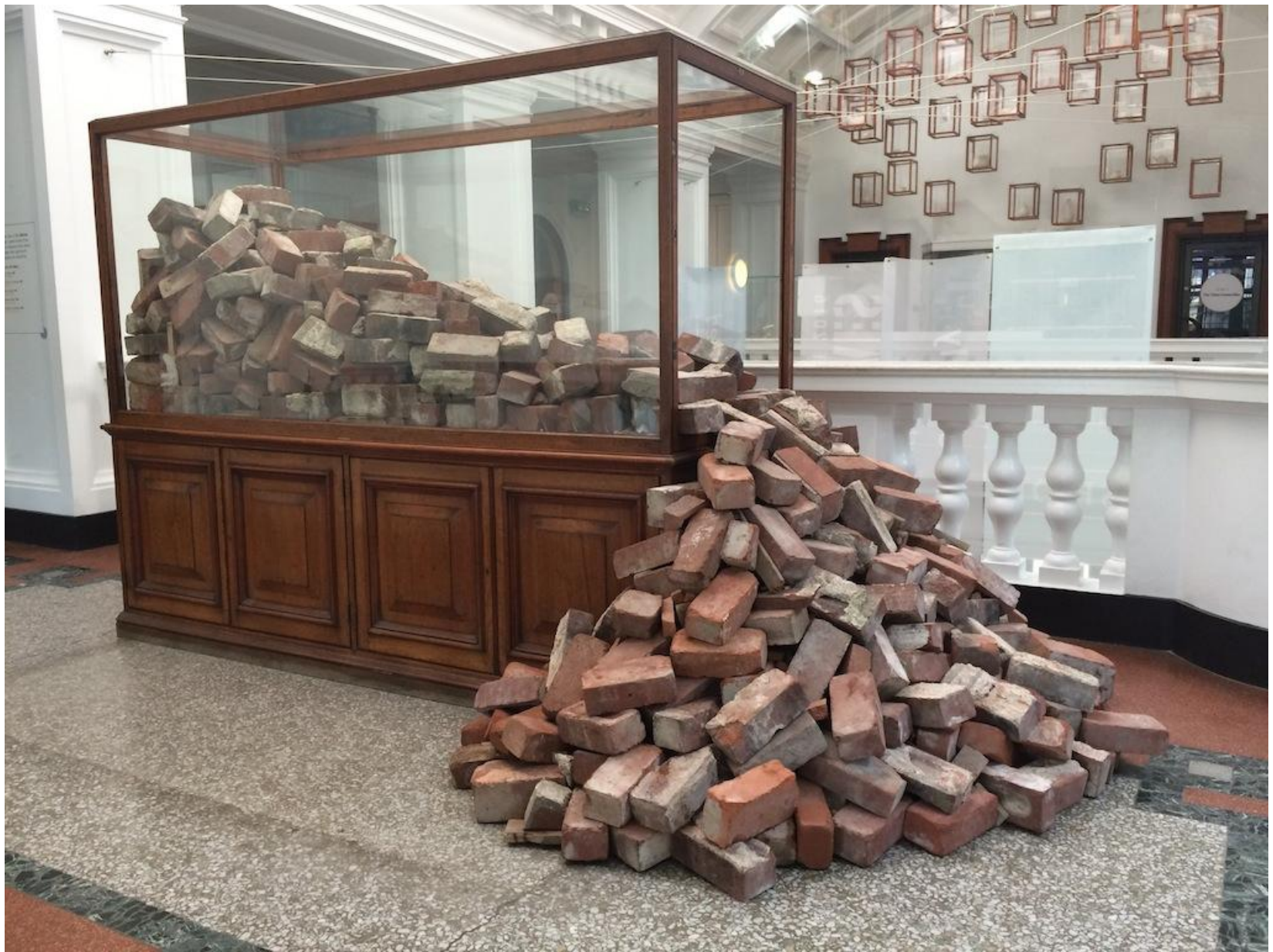
Here is Where We Came From , bricks, museum case, dimensions variable, Plymouth Museum and Art Gallery, 2016. This work was a commission by Plymouth Arts Centre, to celebrate the 75 th anniversary of the blitz.