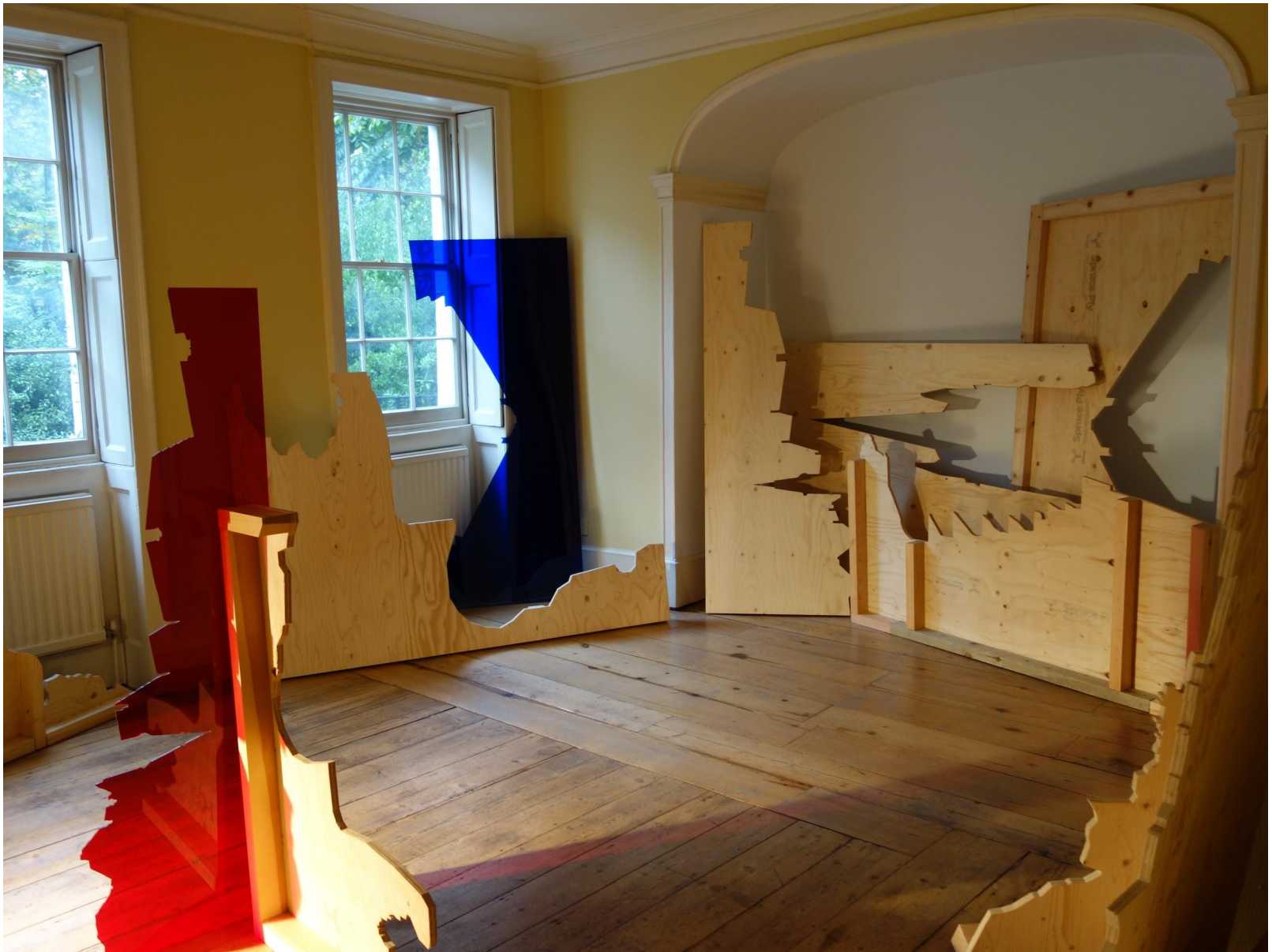
Flats 1 – 9, plywood, Perspex, dimensions variable, Danielle Arnaud Gallery, London, 2020.

A series of cut outs created from photographic skylines within a collection of photographs from the Universal Studio Tour. The proposition is that they are a series of stage flats that can be used to make a set. These were first exhibited in 2018 as part of The Conversation , a solo exhibition at g39, Cardiff.